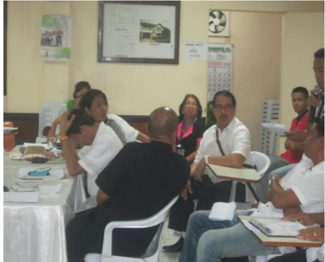
Municipal Housing Board meeting where the LGU's Collector did first reporting.

The following are photo documentation of conducted activities: