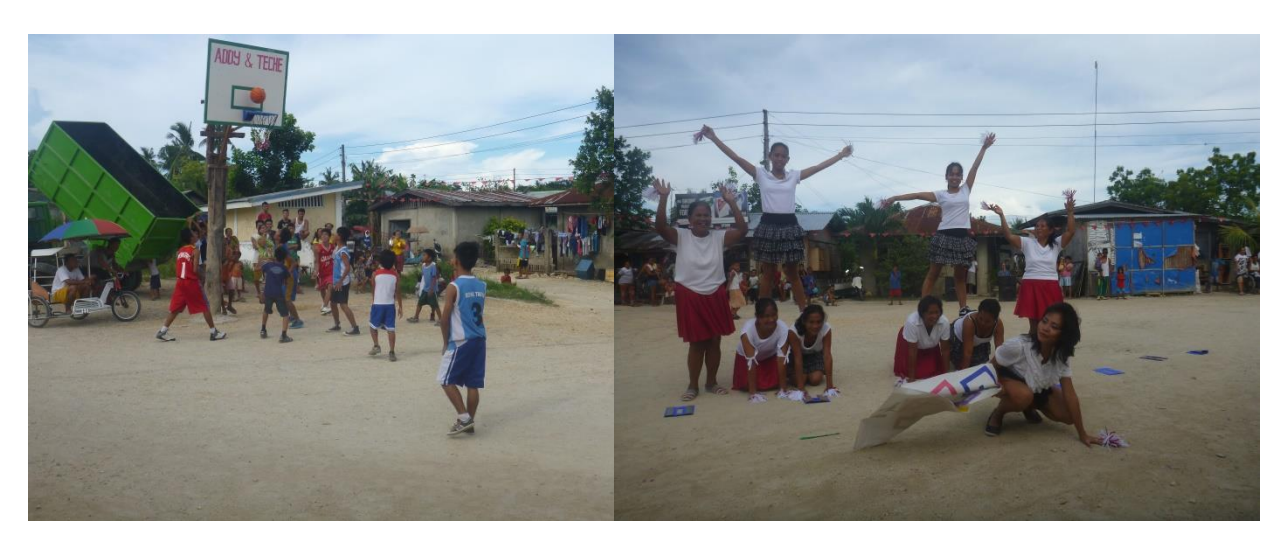
Nice move of the parents who groove...

A. Important Development/Highlights/Changes