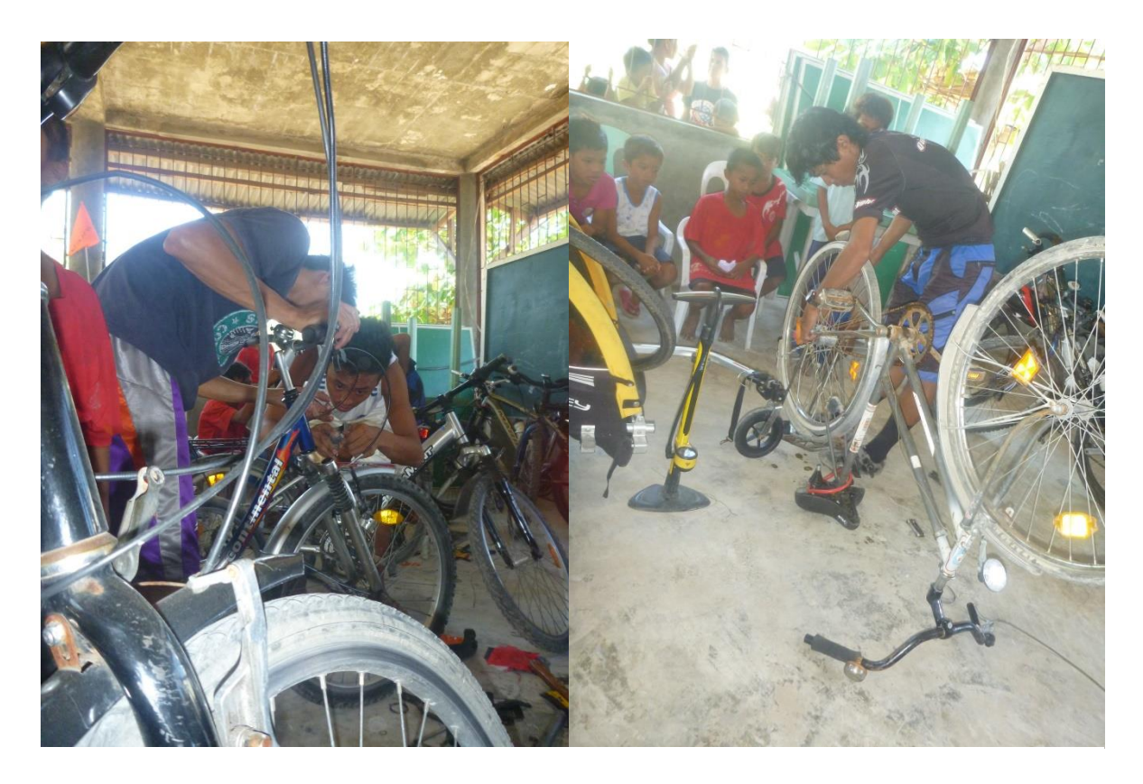
Everyone liked taking good care of their bikes

Last March 1, we had a very successful bike workshop. The scholars were able to learn the basics of repairing their bikes. There was a short orientation done before the workshop in which the scholars got some ideas of what to do and what will happen during the workshop. It was a long day for the scholars and for the facilitators yet it was a fruitful one because most of the bikes were repaired and the scholars were given an assurance of continuous training until they are able to repair on their own bikes.