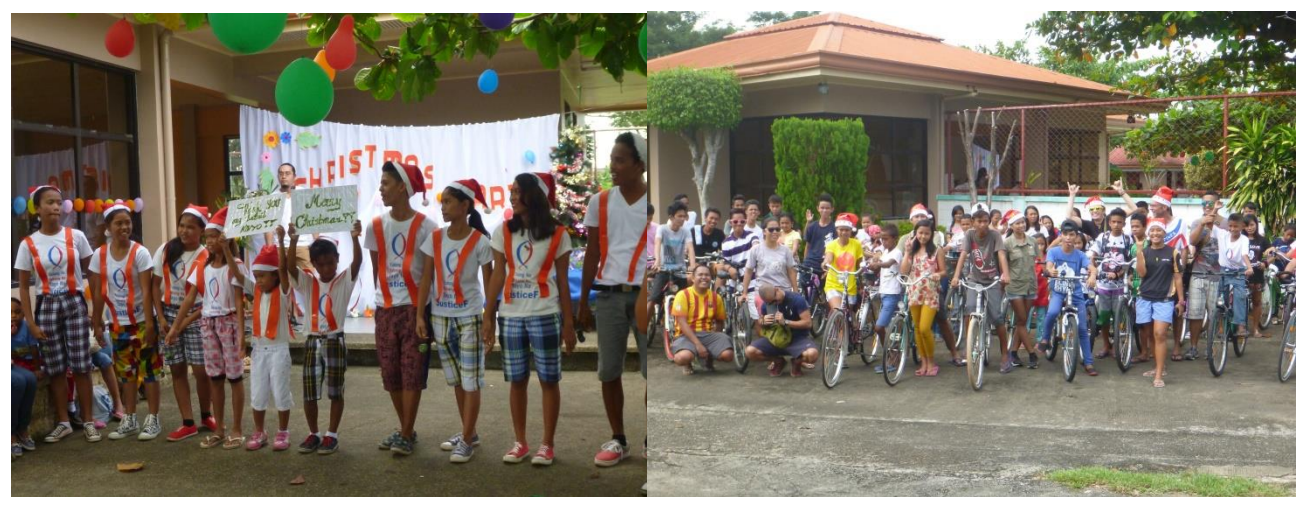
Singing Christmas carol brings joy for all...