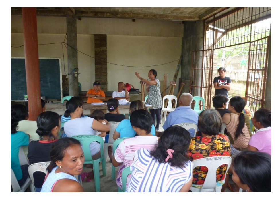
Joint meeting with the Municipal Mayor / project staff and organizational general assembly meeting

Instead of group meetings, the CO did individual follow ups and informal discussion. PO meeting is suspended until the compliance of organizational registration.