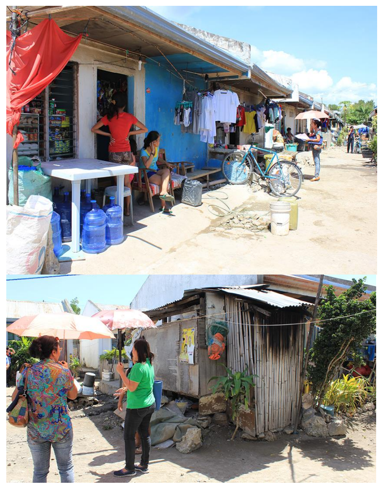
During the conduct of a joint site ocular inspection on March 4, 2015,the CO had a discussion with the Municipal Health staff about sanitation and the available facilities, i.e. septic tank dredging.