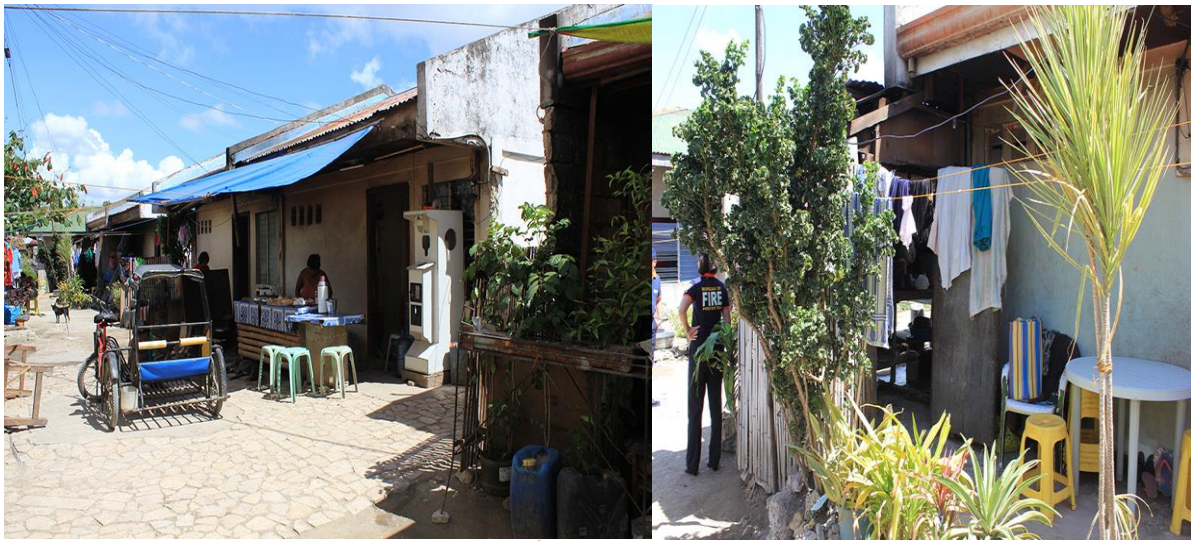
Illegal extension of structures partially cleared

of illegal structures - both partial/full - was implemented by majority of the concerned families and the remaining is a total of \underline{29} houses/families. Some requested for assistance from the Task Force to substantiate the proper clearance of affected area and for economic reasons.